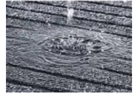
Deep Grooves Trap Dust, Absorb Water And Oil