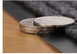
Fits Under Doors Easily, No Blockage