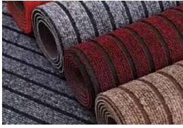
7-Stripe Pattern Mat