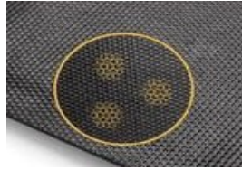
Non-Slip Pvc Backing